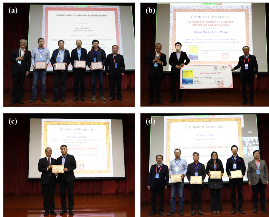
Fig. 3 Photos of the ICGdR Awards winners (Offline only): (a) new ICGdR memberships, (b) ICGdR Geoenvironmental Disaster Best Paper Award for 2019, (c) Science Achievement Award and (d) Outstanding Young Scientist Award