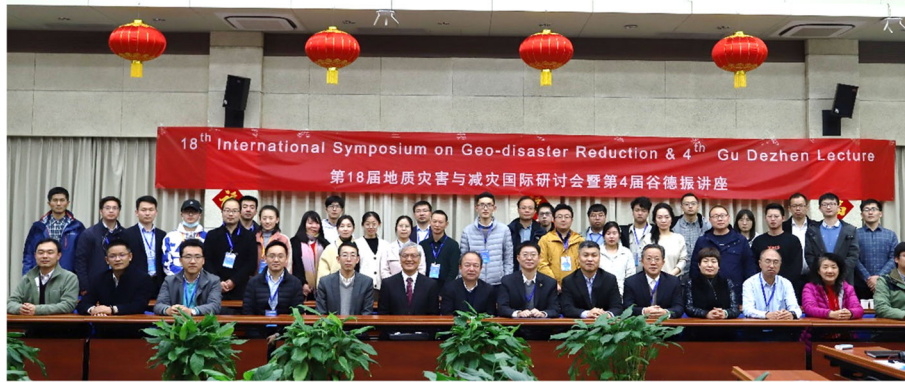
Fig. 7 Group photo of participants at the closing ceremony