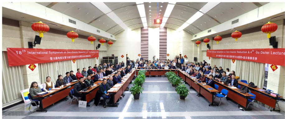
Fig. 2 Group photo of participants of the 18th ISGdR